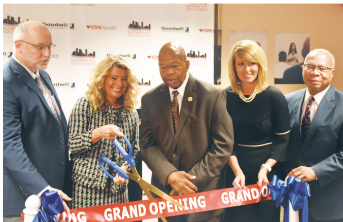
The opening of the CVS mock pharmacy training space in 2018.